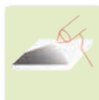
Overlac- quering/ Varnishing